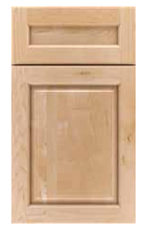
WELZIN 5 PIECE ■ M ®P⊙⊕