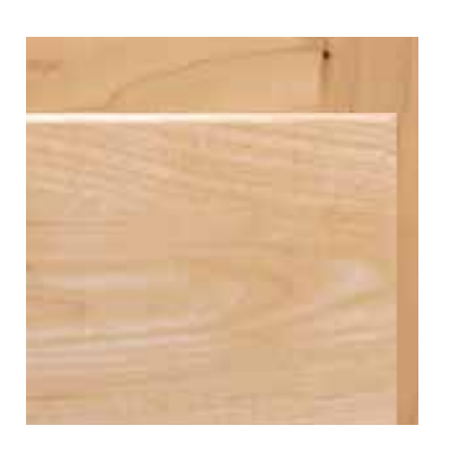
Doors and drawer fronts are the same width as they are in Full Overlay, but height adjusted to allow 1" of the cabinet frame exposed at the top of wall and tall cabinets for easier placement of crown moulding. Doors and drawer fronts appear close together in a cabinet run.