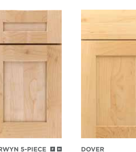
DARWYN 5-PIECE E MPOHR