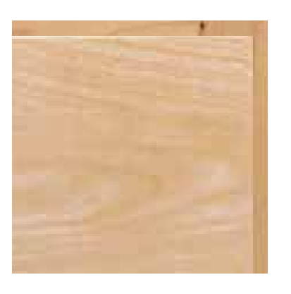
FULL OVERLAY Doors and drawer fronts cover more of the cabinet frame behind them and appear close together in a cabinet run.