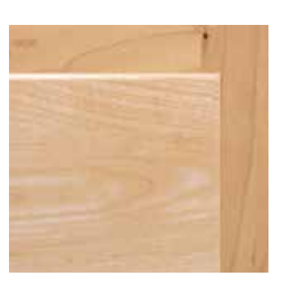
TRADITIONAL OVERLAY Door and drawer fronts show more of the cabinet frame