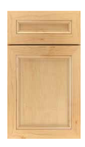
BISHOP 5-PIECE MP0