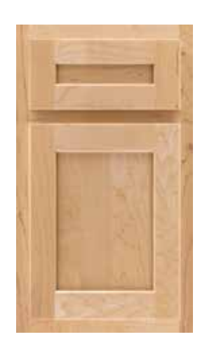
ARBOR 5-Piece MPOHR