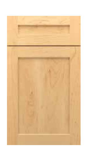
SEDONA 5-PIECE M MPOHR