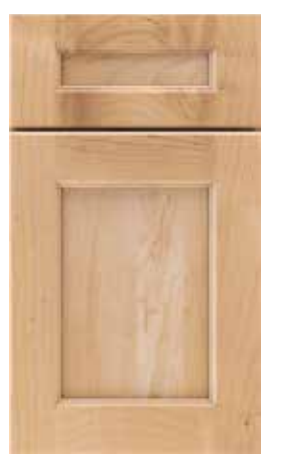
WALDRON 5-PIECE ■ M MPH⊙