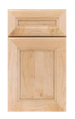
HIGHLAND 5-PIECE EM MP