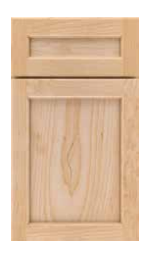
KENDRICK 5-PIECE F MPH0