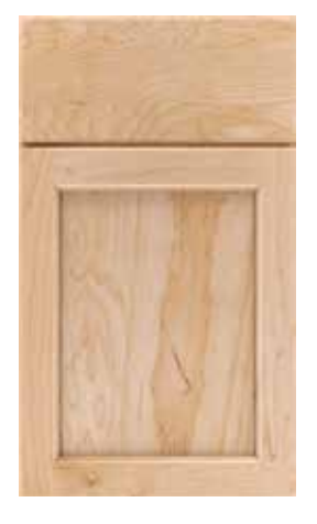
KENDRICK FM MPHO