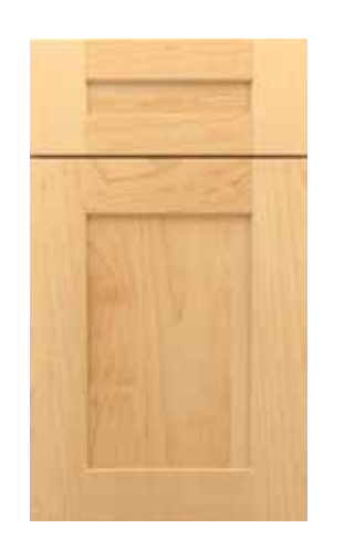
DOVER 5-PIECE MPOHR